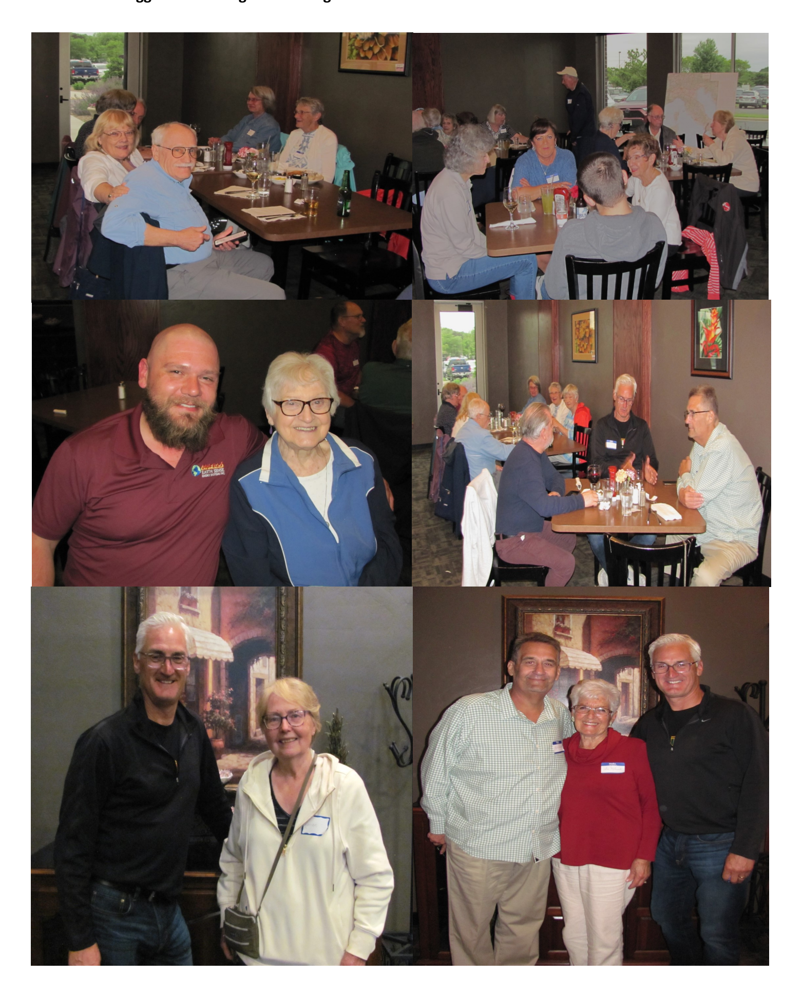
La Prima Passeggiata and Bring A Friend night